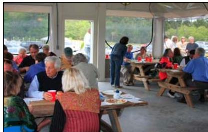
Members of Winyah Rivers Foundation at our Annual Meeting at Osprey Marina