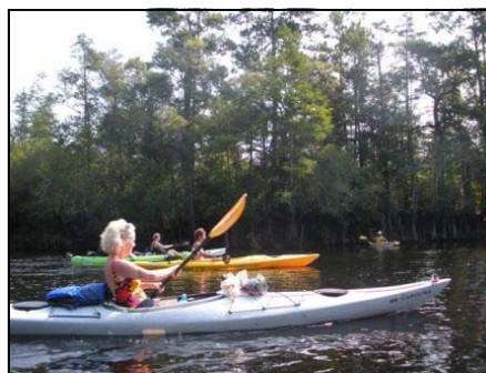
Members of Yakkity Yakers Club

This new paddle series, "If The River Could Talk", is intended to bring more people to the River, to enjoy its beauty and its riches, to bring awareness to the wonderful asset it provides to our community and to our economy, and to solicit stewardship of the Waccamaw River and interest in the Waccamaw RIVERKEEPER® Program.